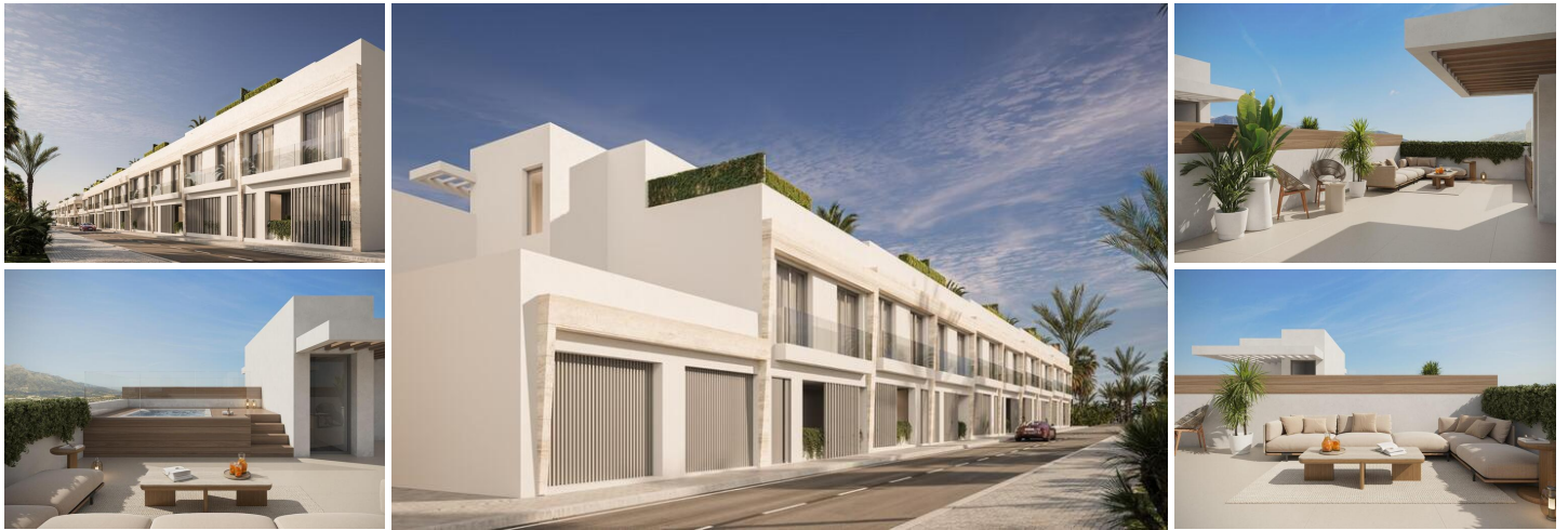
Luxury New Build Villas, Apartments and Townhouses in San Pedro de Alcántara Marbella