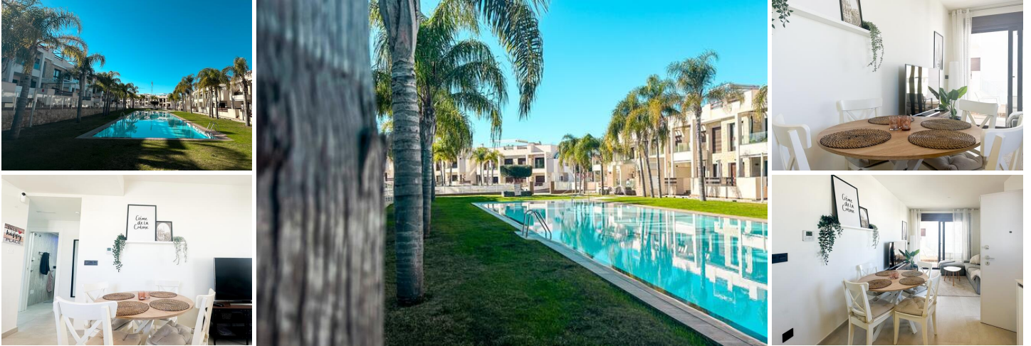
Modern Top-Floor Bungalow with Private Roof Terrace in Los Balcones, Torrevieja

This stylish top-floor bungalow is located in the highly sought-after area of Los Balcones, Torrevieja, just a short distance from the sea and prestigious golf courses, offering the perfect balance between coastal living and leisure