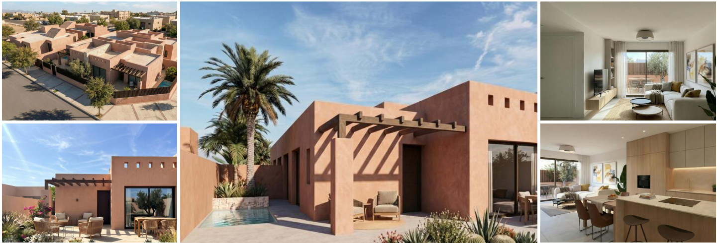
New-build villas at El Alba Mediterranean Resort, in Torre Pacheco