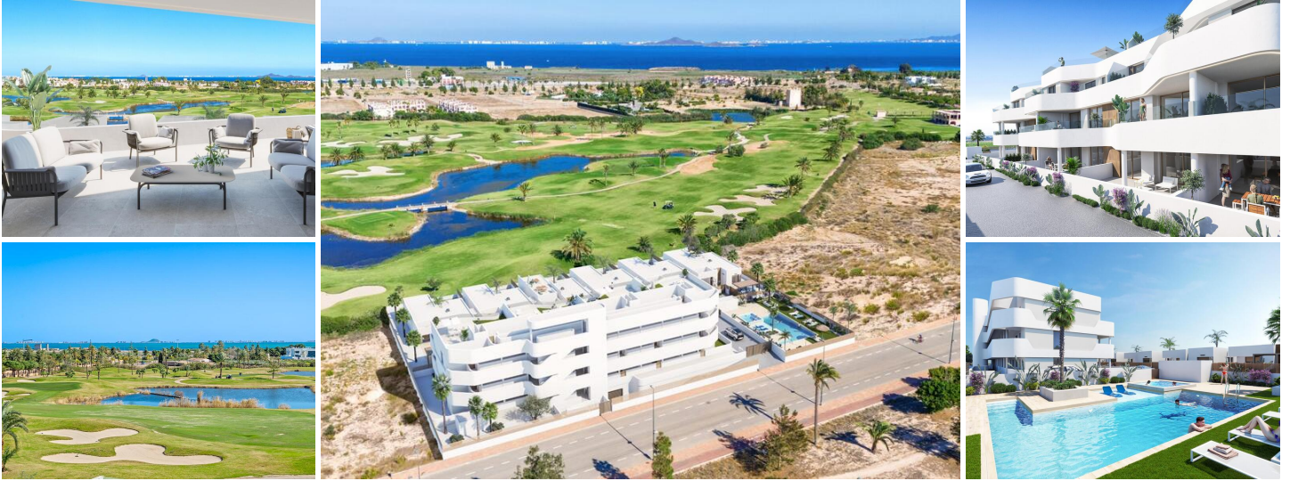
New Build Apartments and Villas Frontline Golf in Los Alcazares Costa Calida