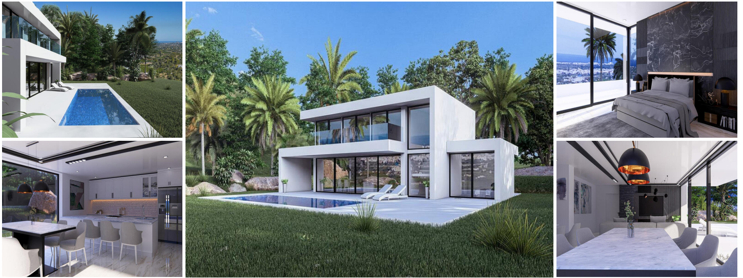
Menorca-Style Villa Project – Custom Design Opportunity in Monte Solana, Pedreguer

Starting from €699,000, this beautiful Formentera-style villa project is set on a sunny south-facing 800 m 2 plot in the highly desirable Monte Solana area of Pedreguer, offering open views, tranquility, and excellent connectivity.