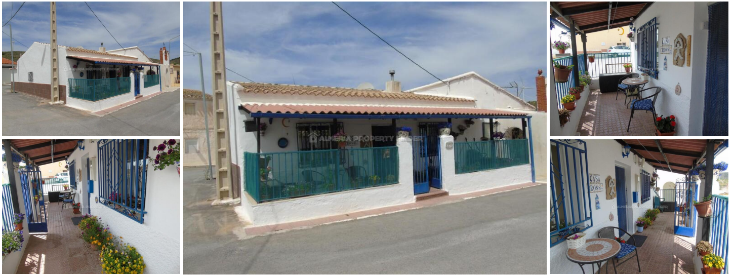
Casa Cruz - A village house in the Seron area. (Renovated)

This pretty semi-detached 2 bedroom, 1 bathroom semi detached village house with garage is located in a tranquil rural village which is serviced by regular deliveries of bread, groceries, fish and gas bottles, etc. It is around 5 minutes drive from the town of El Hijate which offers all amenities for daily living, and 25 minutes from the large town of Baza which offers all amenities. From Baza, the A-92N motorway gives easy access to Granada airport and the Sierra Nevada ski resort and, in the other direction, to the coastal motorway which gives access to the airports of Almeria, Murcia and Alicante.