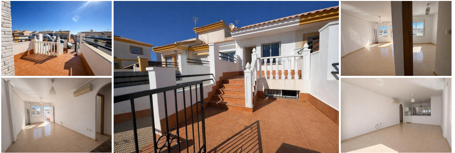
Charming South-Facing Townhouse in Sucina – Walking Distance to the Village Centre

This cosy townhouse, attached on both sides, is a charming bungalow-style property offering comfort, natural light, and excellent outdoor space.