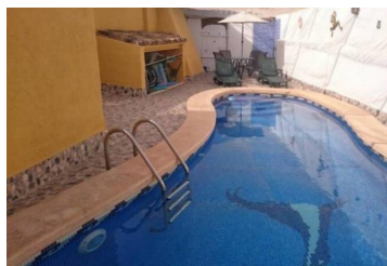
4 sovrum Villa till salu i Fuente Alamo, Murcia