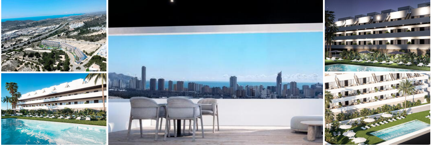
Exclusive New Build Residences with Sea Views in Finestrat, Alicante

Prime Location with Panoramic Views of Benidorm and the Mediterranean