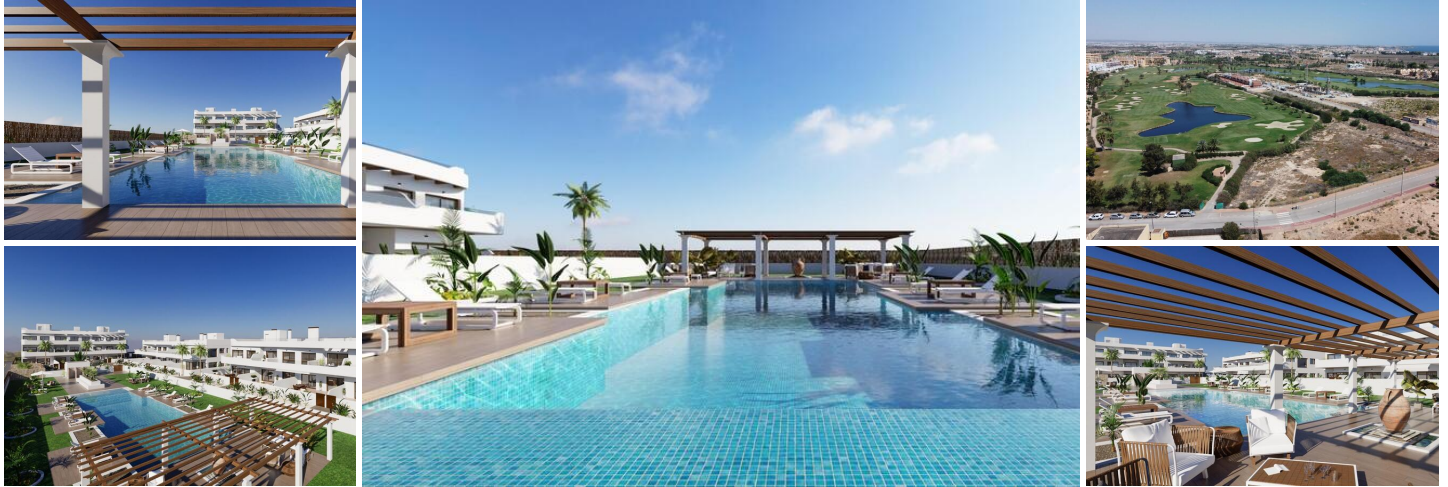
New Build Residential Complex Near Serena Golf and the Mar Menor in Los Alcazares