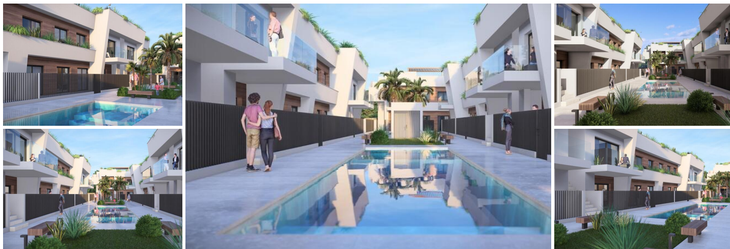
New Construction Homes in Torre-Pacheco, Costa Cálida