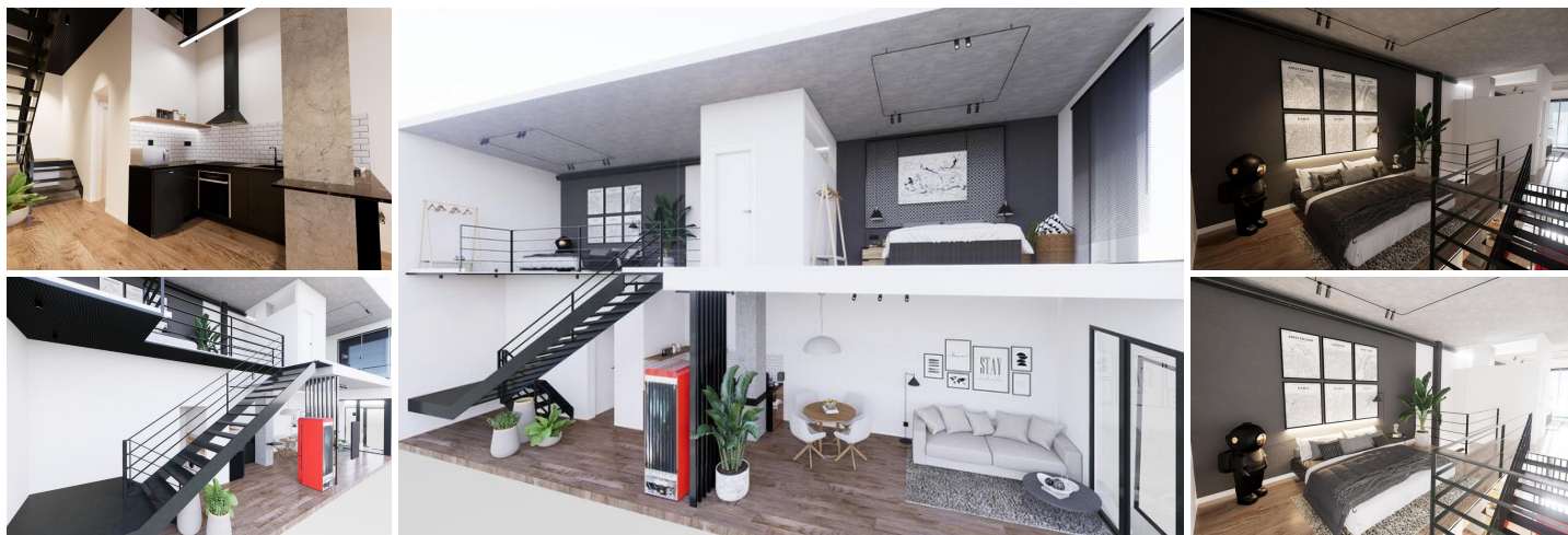
Modern Duplex Loft Apartments in the Heart of Alicante