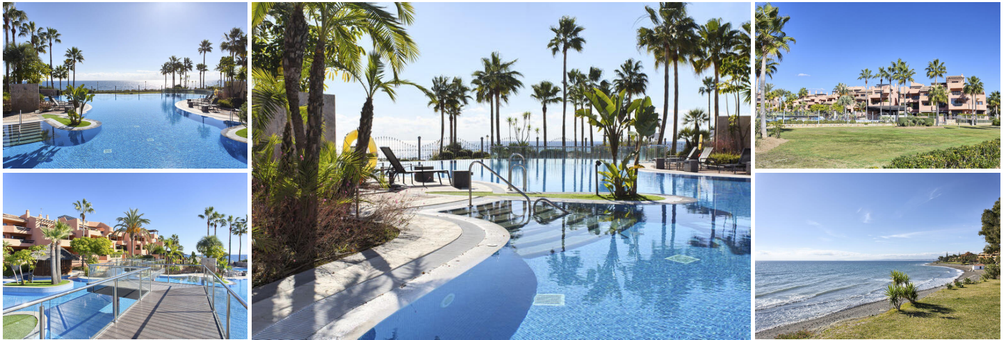
2-Bedroom Apartment in Exclusive Beachfront Urbanization – Mar Azul, New Golden Mile, Estepona

Set within the prestigious beachfront community of Mar Azul on Estepona's highly desirable New Golden Mile, this elegant 2-bedroom, 2-bathroom apartment offers a refined coastal lifestyle with direct beach access and outstanding on-site facilities. The vibrant Estepona town centre, with its restaurants, bars, and shops, is within easy walking distance.