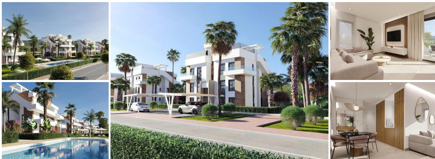
New Build Apartments in Hacienda del Álamo Golf Resort, Murcia