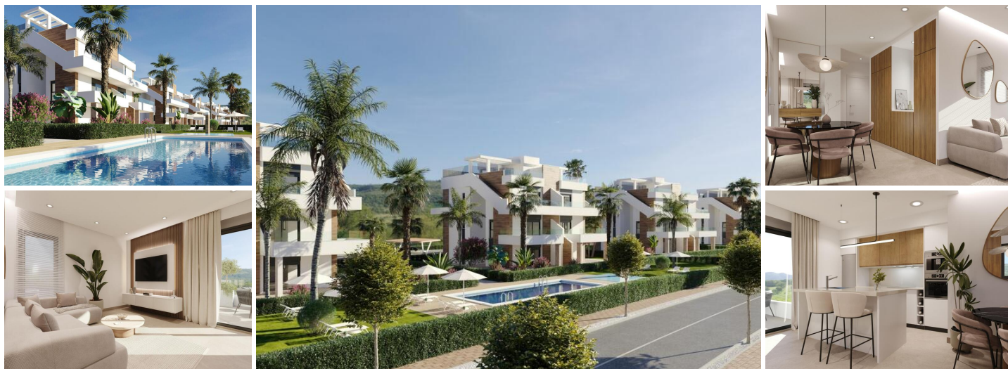
New Build Apartments in Hacienda del Álamo Golf Resort, Murcia