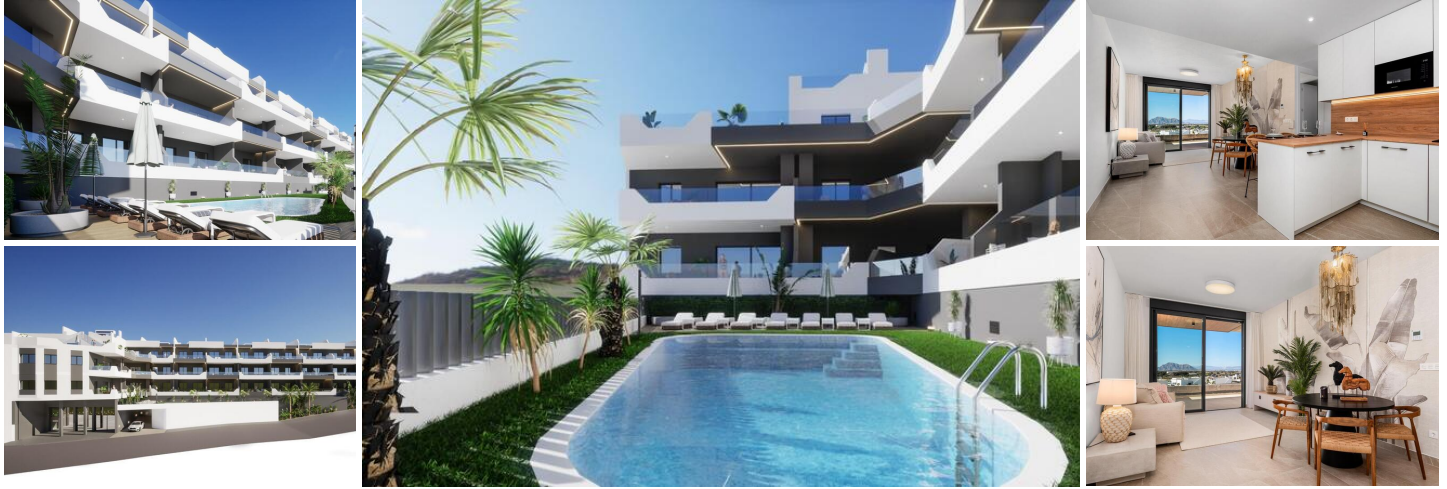
NEW BUILD BUILD RESIDENTIAL COMPLEX IN BENIJOFAR

New Build residential complex in the quiet area of Benijofar.