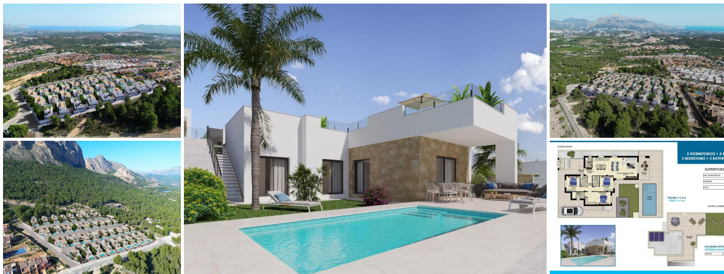
Stunning New Build Villas in Polop with Sea Views