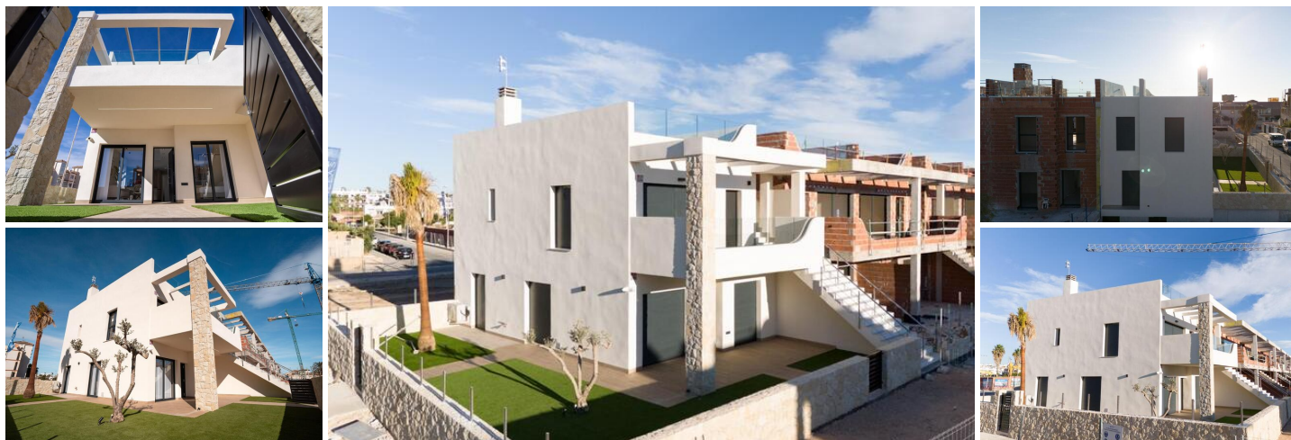
New build bungalows in Pilar de la Horadada