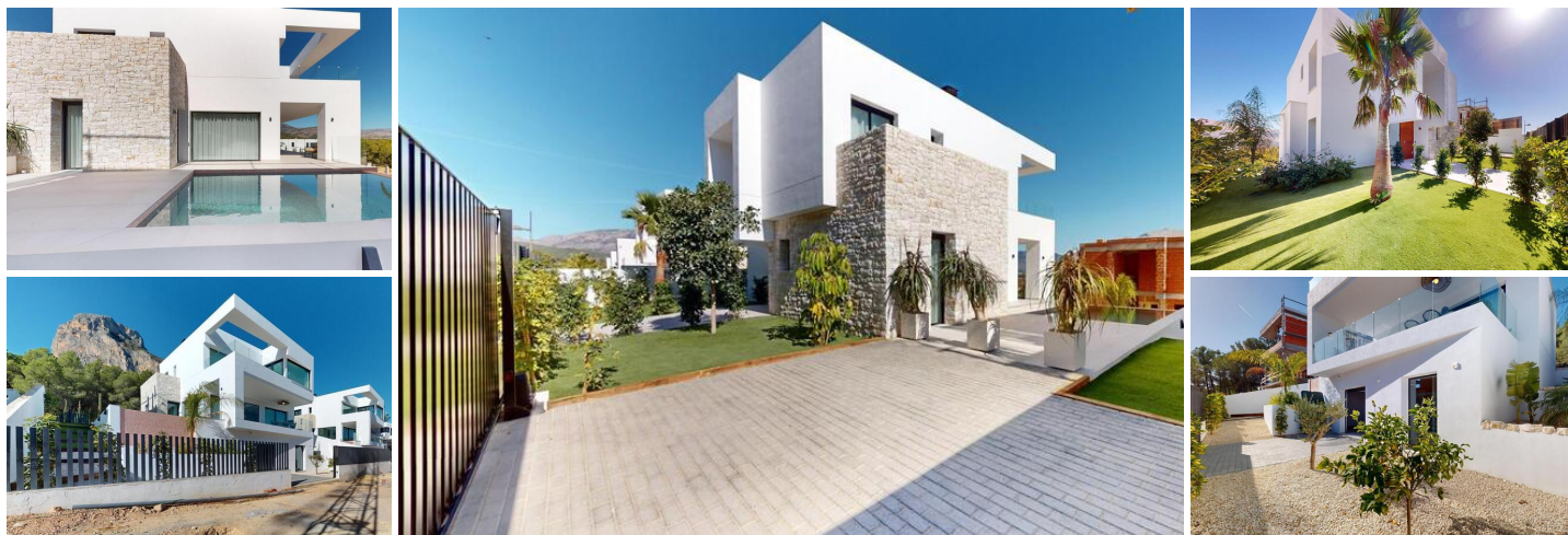
New Build Luxury Villas in Polop with Stunning Views Exclusive Development of 6 Luxury Villas in Polop

This brand-new promotion of 6 luxury villas is located in Polop, offering breathtaking views of the sea and mountains. Each villa is built on an independent plot with a private swimming pool, parking, barbecue area, and a spacious garden. The villas are spread over two floors plus a semi-basement, with a total of 293 m 2 on private plots of 393 m 2 .