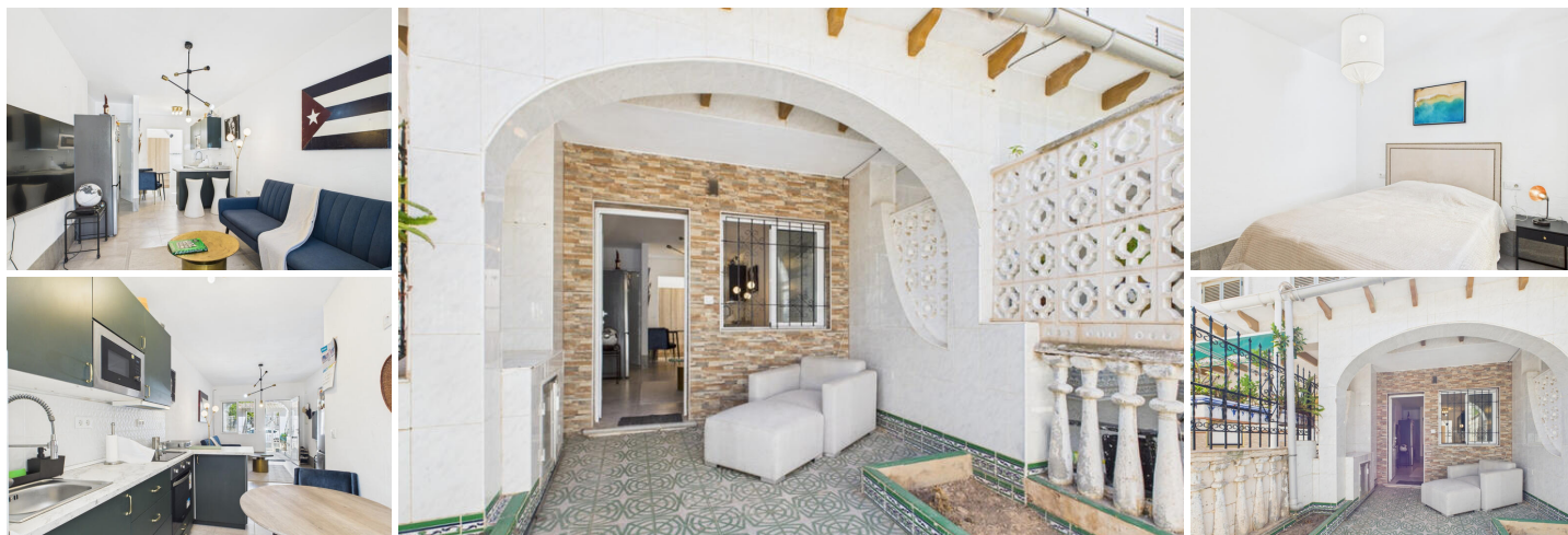
1-Bed Ground-Floor Bungalow with Front Patio - Los Alcazares

Well-located ground-floor bungalow just a short walk to local amenities and the beach. It offers a bright living area, one bedroom, a bathroom, and a kitchen, plus a private front patio for relaxing outdoors. Sold with no furniture; furniture is negotiable. Ideal as a holiday home, investment, or year-round residence.