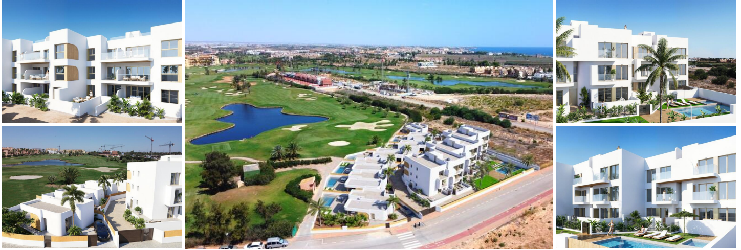
New Build Residential Complex in Los Alcázares on the Frontline of Serena Golf