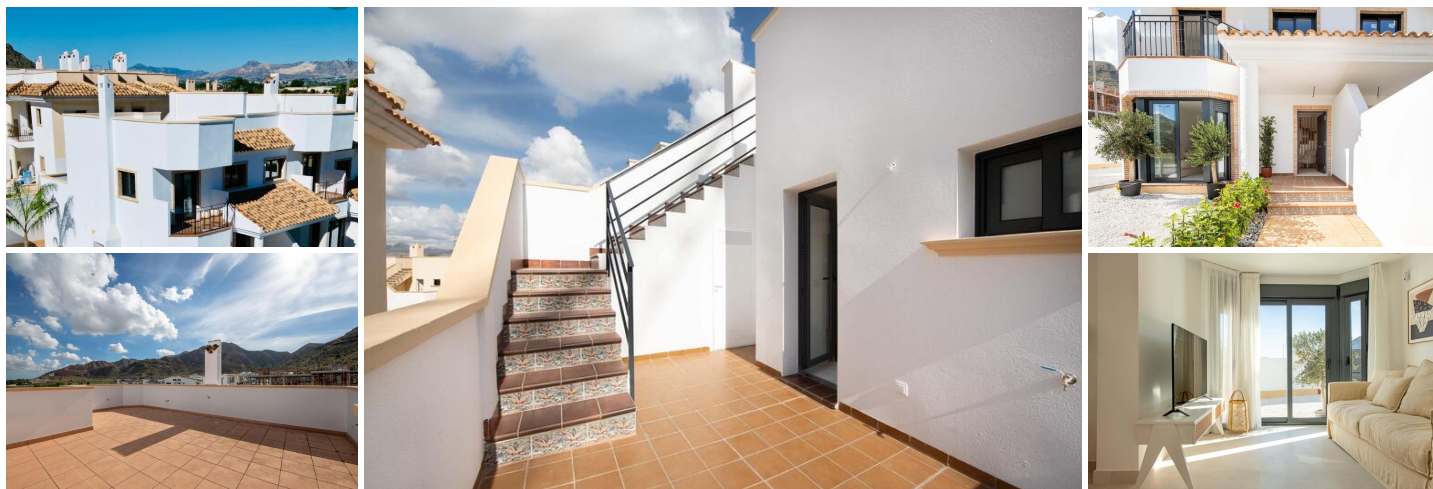
New Bungalows and Townhouses in Cox, Alicante