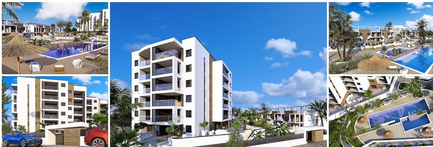
New Build Apartments and Bungalows in Mil Palmeras