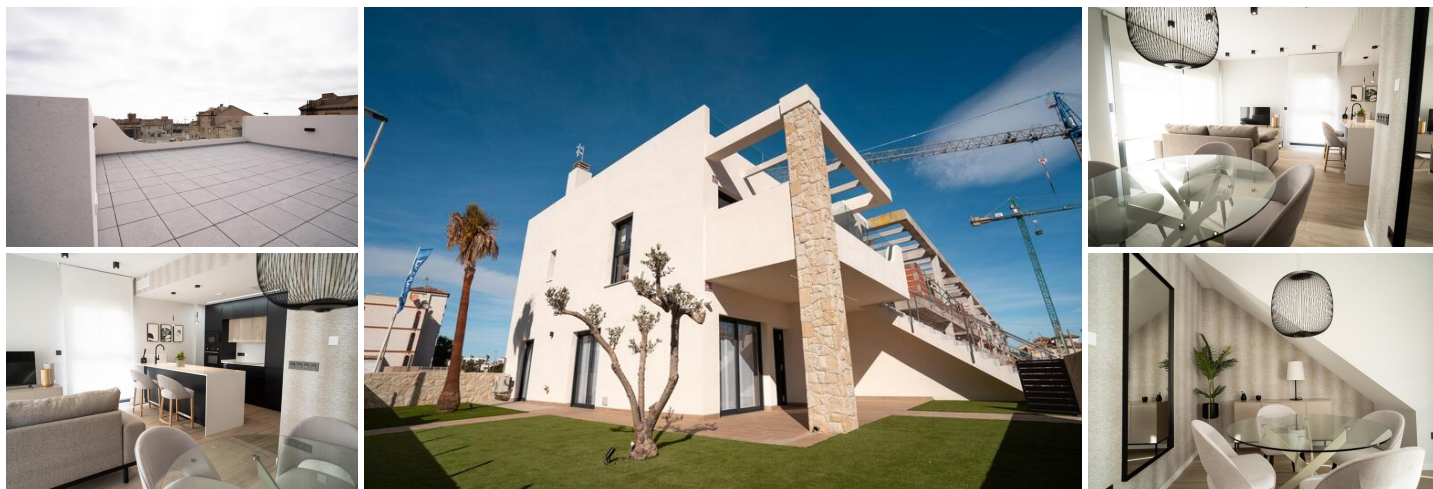
New build bungalows in Pilar de la Horadada