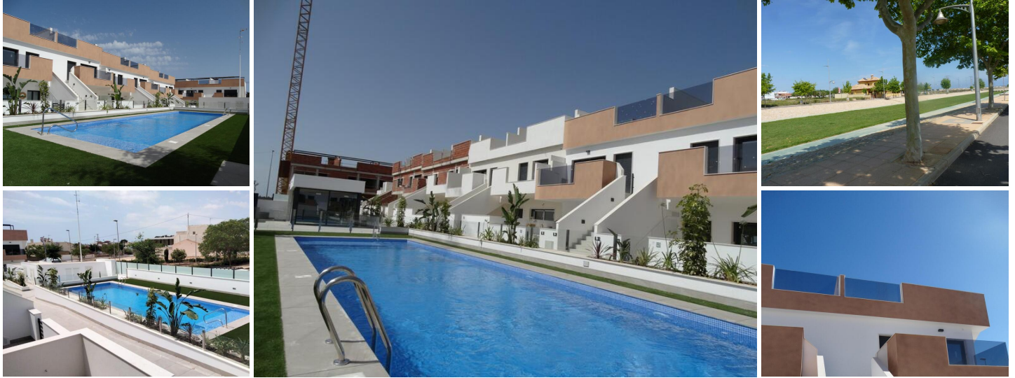
Newly Built Bungalows with Solarium or Garden in Pilar de la Horadada