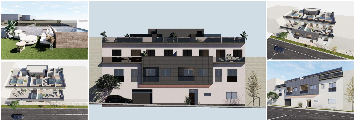
New Build Apartments in Pilar de la Horadada with private Jacuzzi