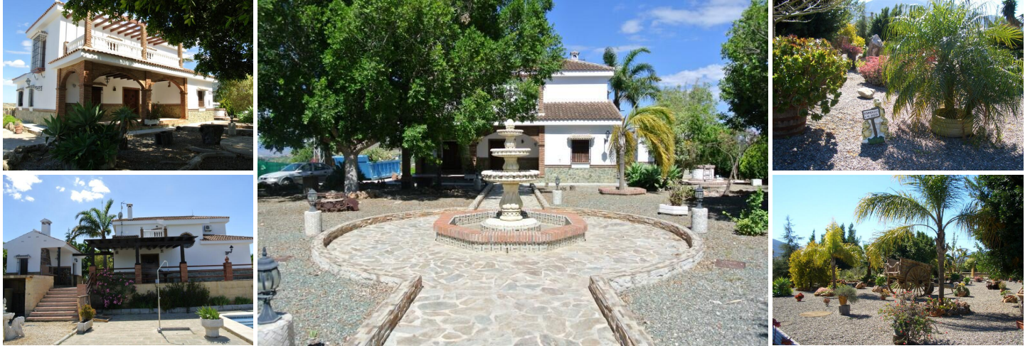
Spacious Two-Storey Finca on a 12,000m 2 Olive Plot – Alhaurín el Grande

Discover this expansive, unfurnished finca located on the outskirts of Alhaurín el Grande, easily accessed via a flat track and set within peaceful countryside surroundings. Offering generous living space across two floors, the property enjoys complete privacy, beautiful landscaped gardens, and breathtaking panoramic views.