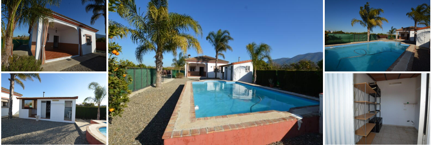
Charming Rural Chalet with Pool and Barbecue Area

This lovely chalet is set in a peaceful rural location surrounded by fruit trees, offering complete privacy and a relaxing atmosphere. The property features a swimming pool, a fully equipped barbecue area, and ample parking space for several vehicles, with easy access via a paved road.