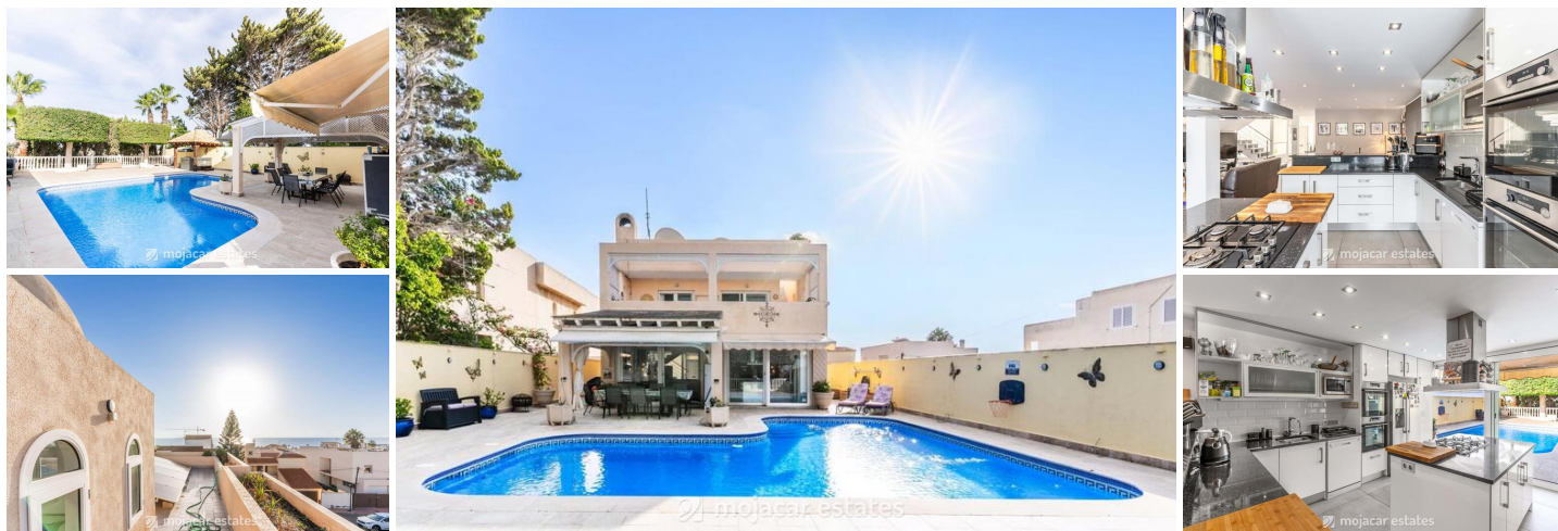
Detached Villa with Private Pool and Sea Views in Garrucha, Almeria.

Located just 300 metres from the beach and within easy walking distance of Garrucha's marina, this detached 5-bedroom villa offers generous living space, private outdoor areas, and sea views from the upper terrace. With approximately 320m 2 of built area on a 600m 2 plot, the property is designed for comfortable coastal living, whether as a full-time home, holiday base, or rental investment.