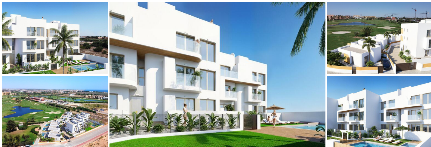
New Build Residential Complex in Los Alcázares on the Frontline of Serena Golf