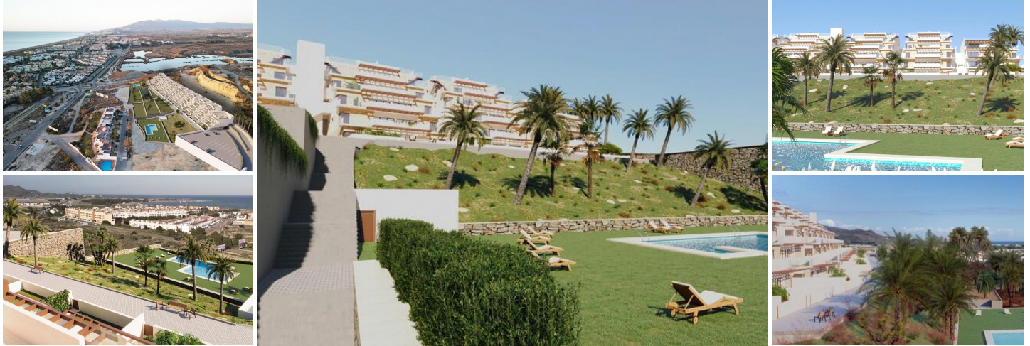
New Build Apartments with Sea Views in Vera Playa, Almería

Discover this exceptional new residential development in Vera Playa, offering 27 modern apartments in its first phase. Designed to combine comfort, functionality, and spectacular Mediterranean views, this project is ideal for those seeking a home on the Costa de Almería with style and convenience.