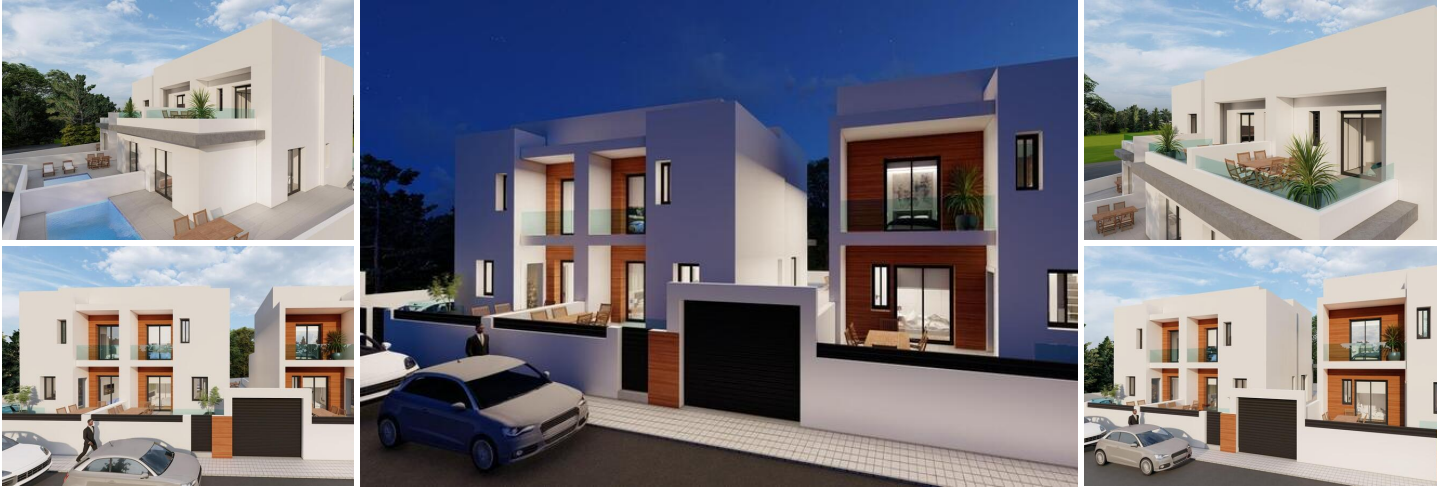
New Build Villas with Private Pool in Daya Nueva, Costa Blanca