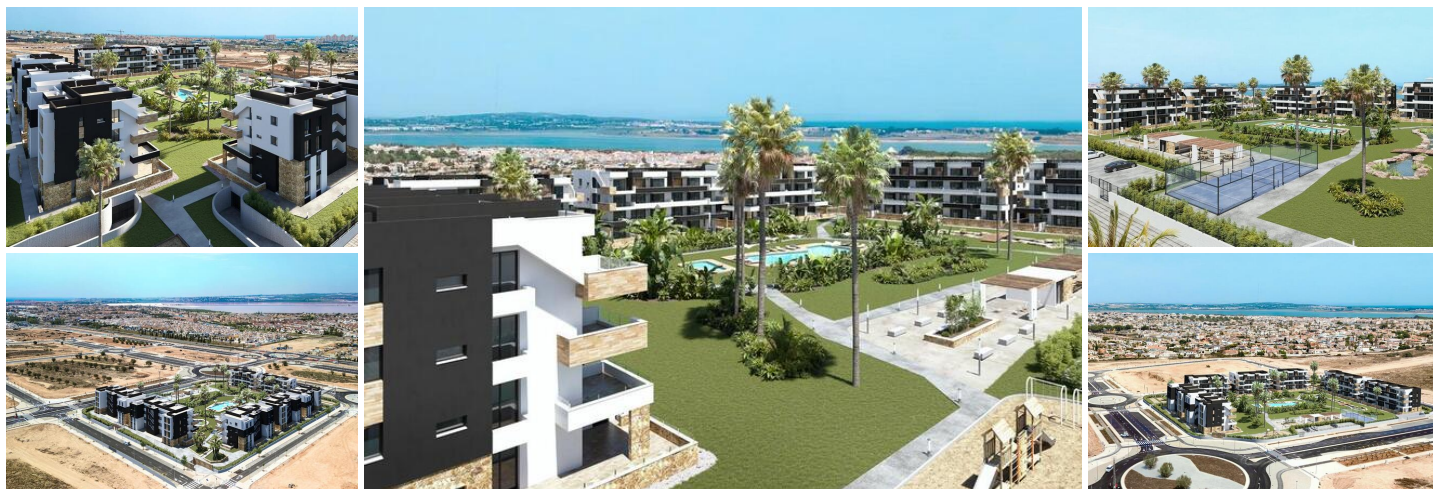
New Residential Development in La Siesta, Torrevieja