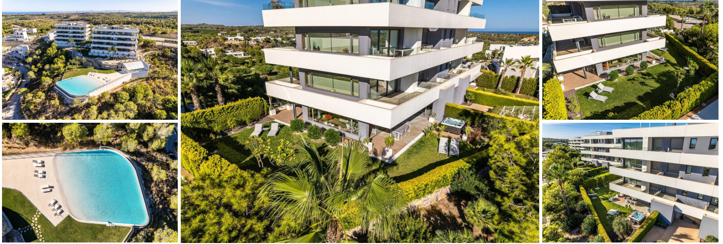
Extraordinary Ground Floor Apartment, Madroño Community, Las Colinas Golf & Country Club

Welcome to pure luxury living in one of the most exclusive communities of Las Colinas. This 2021 ground floor residence is unlike anything you have seen before, a home that blends the comfort of a villa with the ease of apartment living.