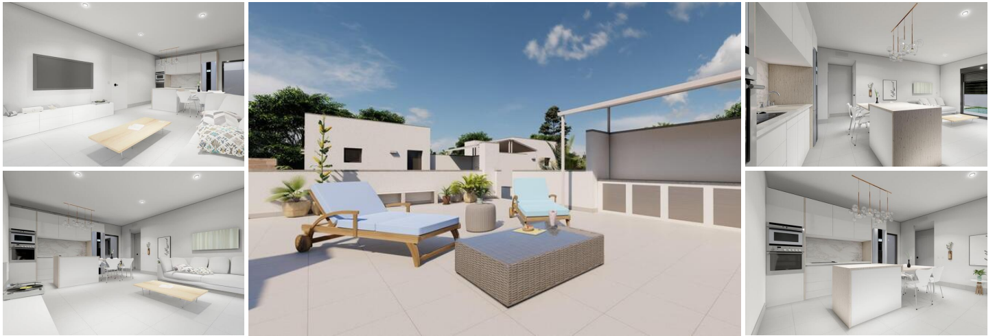
Semi-detached and Semi-detached Villas in Roldán, Murcia, Spain