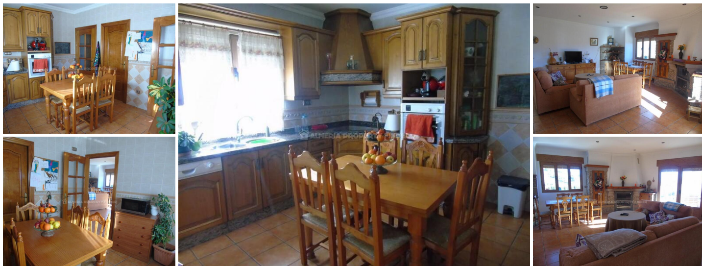
Villa Angel - A villa in the Oria area. (Resale)

A larger than average size 4 bedroom, 2 bathroom villa with a build of 215m 2 in the village of Los Cerricos and within easy walking distance of a local bar/resturant. The property is approximately a 10 minute drive to the charming small town of Chirivel which offers all amenities for daily living. The town of Chirivel has excellent access to the A92 motorway which leads to Granada and the Sierra Nevada ski resort in one direction, and to the coastal motorway and airports of Almeria, Murcia and Alicante in the other direction.