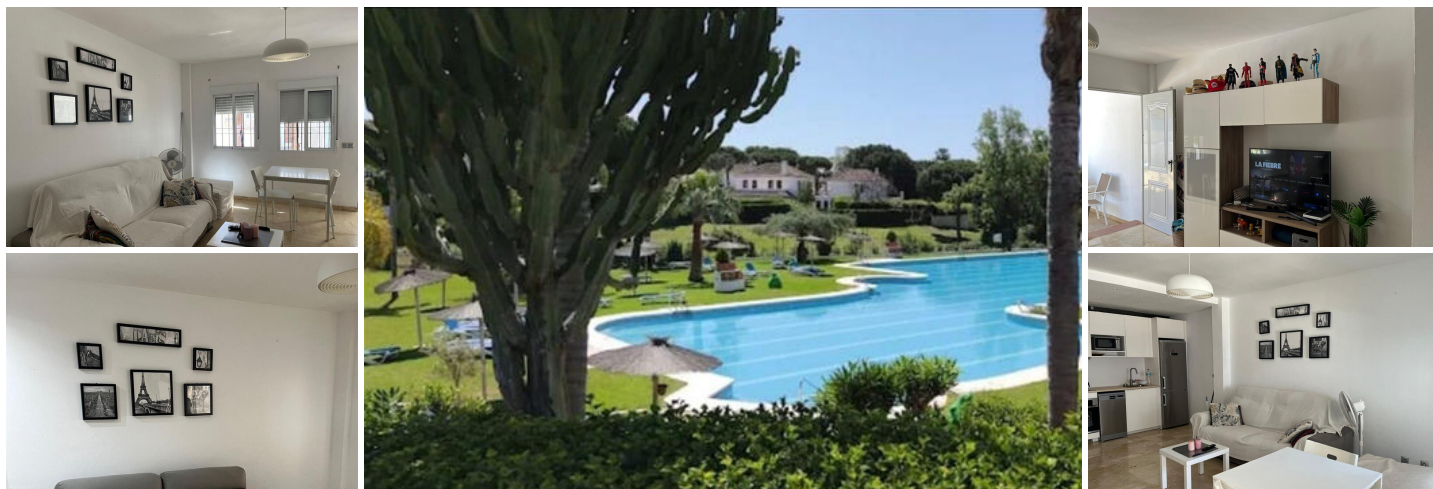
Benamara, Estepona – Charming One-Bedroom Apartment

This inviting ground-floor apartment is set within a well-established residential community, surrounded by beautifully maintained, mature gardens and featuring a large swimming pool area. Just a short stroll brings you to the stunning sandy beaches, while a wide selection of restaurants, bars, and local amenities are right on your doorstep. Golf enthusiasts will also appreciate the many renowned courses located nearby.