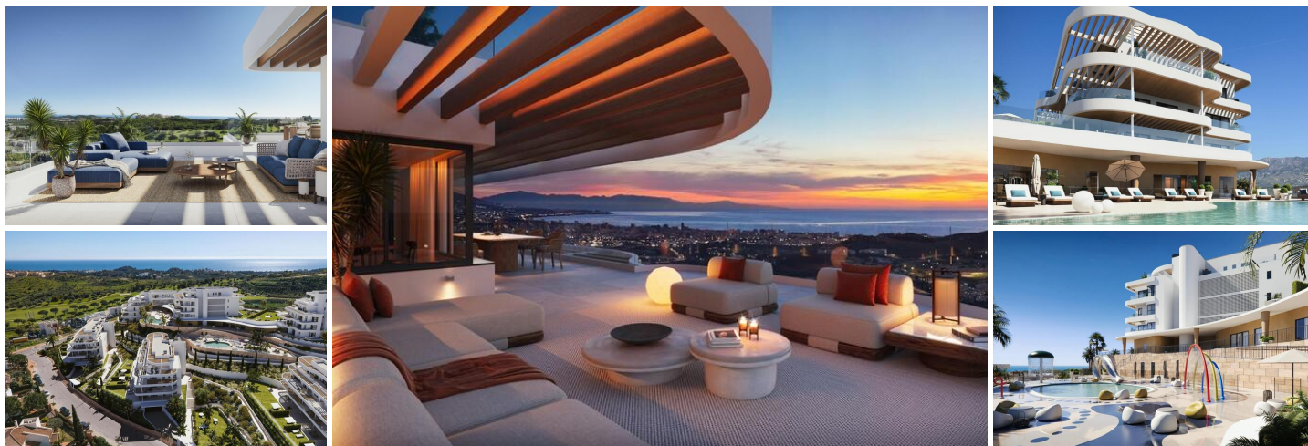
Luxury New Build Apartments in Cerrado del Águila Golf, Mijas with Sea and Golf Views

Experience an exclusive lifestyle in this modern new build resort located in the prestigious Cerrado del Águila Golf area of Mijas. Surrounded by nature and boasting panoramic 360° views of the Mediterranean Sea, mountain view and the golf course, this development offers the perfect combination of elegance, comfort, and convenience on the Costa del Sol.