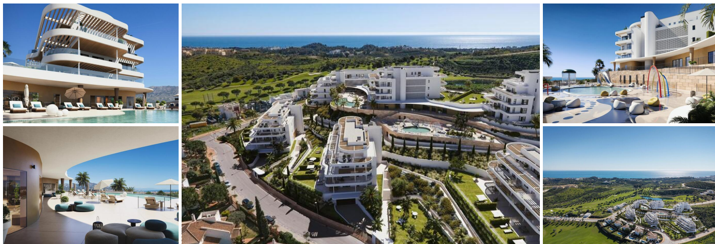
Luxury New Build Apartments in Cerrado del Águila Golf, Mijas with Sea and Golf Views

Experience an exclusive lifestyle in this modern new build resort located in the prestigious Cerrado del Águila Golf area of Mijas. Surrounded by nature and boasting panoramic 360° views of the Mediterranean Sea, mountain view and the golf course, this development offers the perfect combination of elegance, comfort, and convenience on the Costa del Sol.