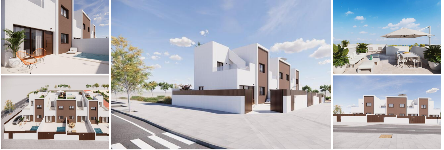
Modern New Build Villas with Optional Private Pool in Pilar de la Horadada