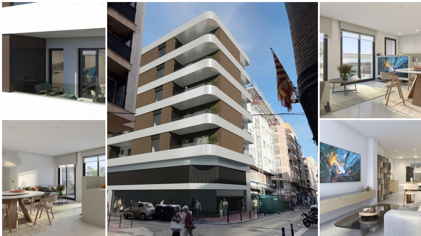
Modern New-Build Apartments in Santa Pola Just 500 Meters from the Beach