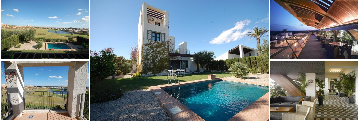
Elegant detached villas with private pool at Peraleja Golf Resort - Costa Cálida

Mediterranean-style detached houses in a gated golf community