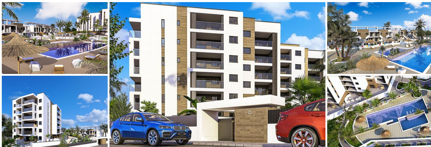
New Build Apartments and Bungalows in Mil Palmeras