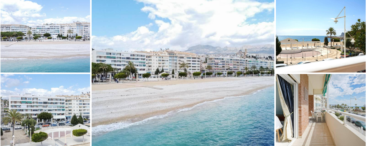
Front line beach apartment for sale in Altea,

This fantastic two bedroom flat is situated on the first floor of an apartment building in the beautiful Playa de la Roda in Altea. The flat offers beautiful sea views from the covered terrace and from the living room, the kitchen and the master bedroom. It has a total living area of 88 m 2 and consists of a spacious living-dining room with open kitchen, a double bedroom, a bedroom with bathroom en suite, a separate bathroom and a laundry room. Thanks to the high ceilings, bunk beds can easily be placed in the bedrooms to create additional sleeping space. Both the living room and the master bedroom have direct access to the terrace through sliding windows. Thanks to the south-east orientation, you will enjoy plenty of natural light throughout the day. For extra comfort, the flat is equipped with air conditioning hot/cold and several storage rooms. The flat has been recently renovated, allowing you to move in immediately! There is also a lift in the building to ensure comfort.