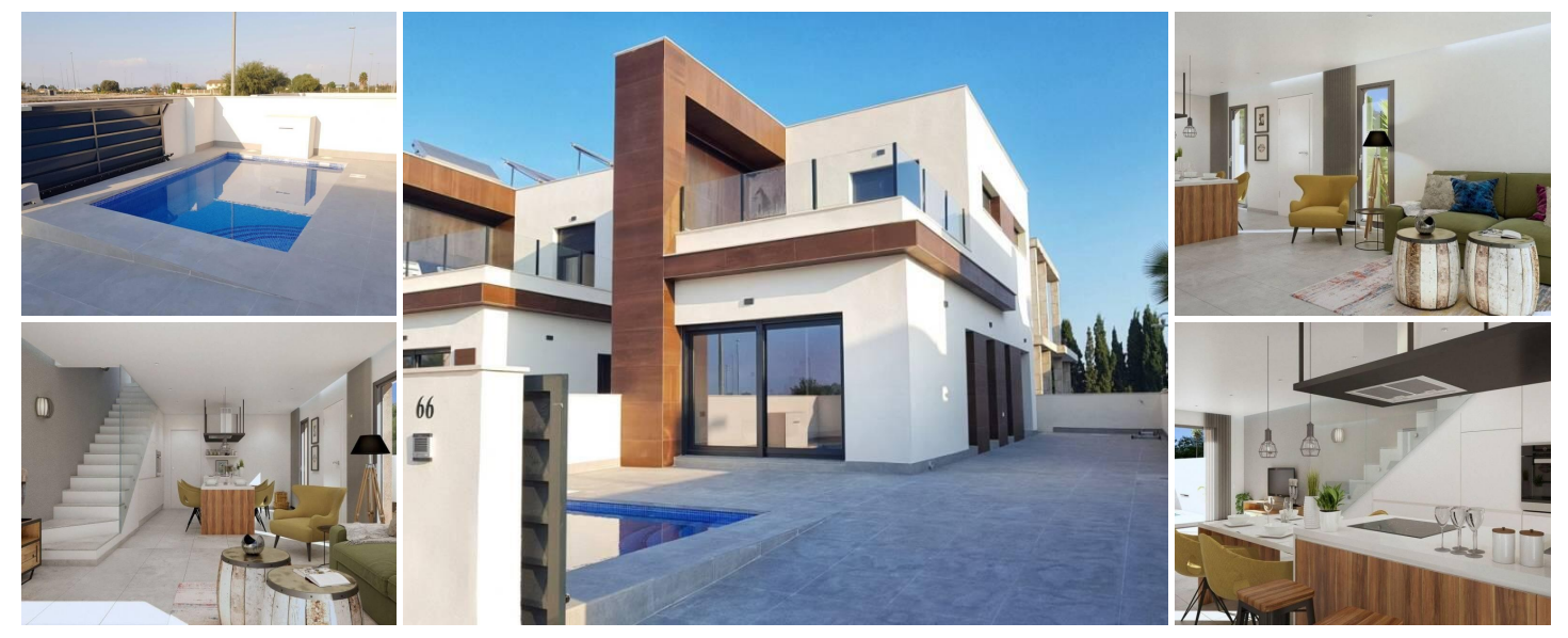
NEW SEMI-DETACHED VILLAS IN DAYA NUEVA

New build semi-detached villas in the new part of Daya Nueva. Just a few minutes walk to the centre of the town.