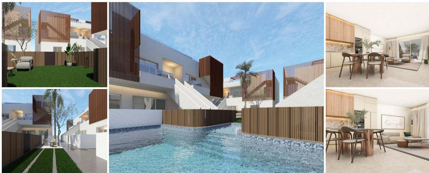
New Build Bungalows with Comunal Pool in Pilar de la Horadada – Costa Blanca South