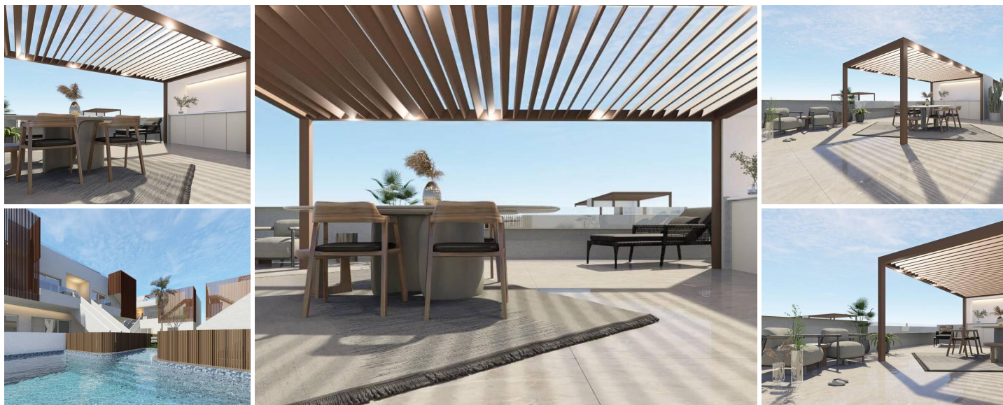
New Build Bungalows with Comunal Pool in Pilar de la Horadada – Costa Blanca South

Modern Residences Close to the Beach and Town Centre