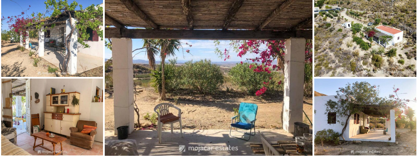
Rustic 2-Bed House with Well & Stunning Views Near Mojácar, Almeria, Andalusia.

This rustic 2-bedroom house is set in a peaceful countryside location between Mojácar and Turre, offering breathtaking mountain and valley views. The 73m 2 home features a 33m 2 covered porch, providing a charming outdoor space to relax and enjoy the scenery. Surrounded by natural beauty, the property has a legalised well with abundant water, making it a great option for those seeking tranquility and self-sufficiency while remaining just a short drive from local amenities.