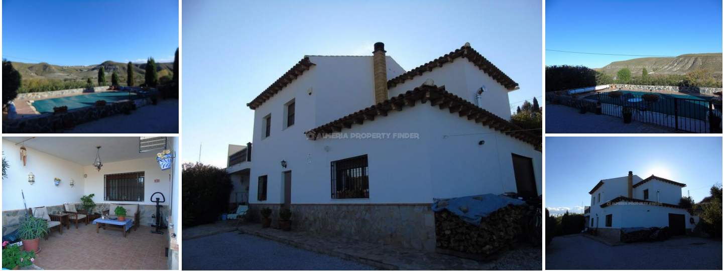
Cortijo Adella - A country house in the Caniles area. (Resale)