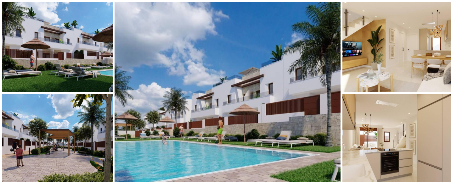
New Build Homes in Vistabella Golf Resort, Orihuela